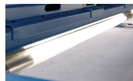
Lighting tubes LED