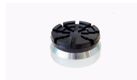
Height adapter 44 mm