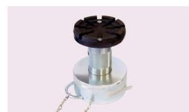
Height adapter 155-245 mm