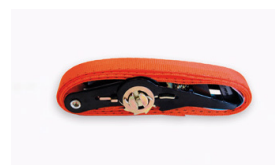
Lashing straps (2 units)