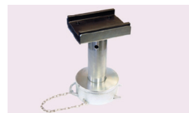
U-form adapter 150-233 mm