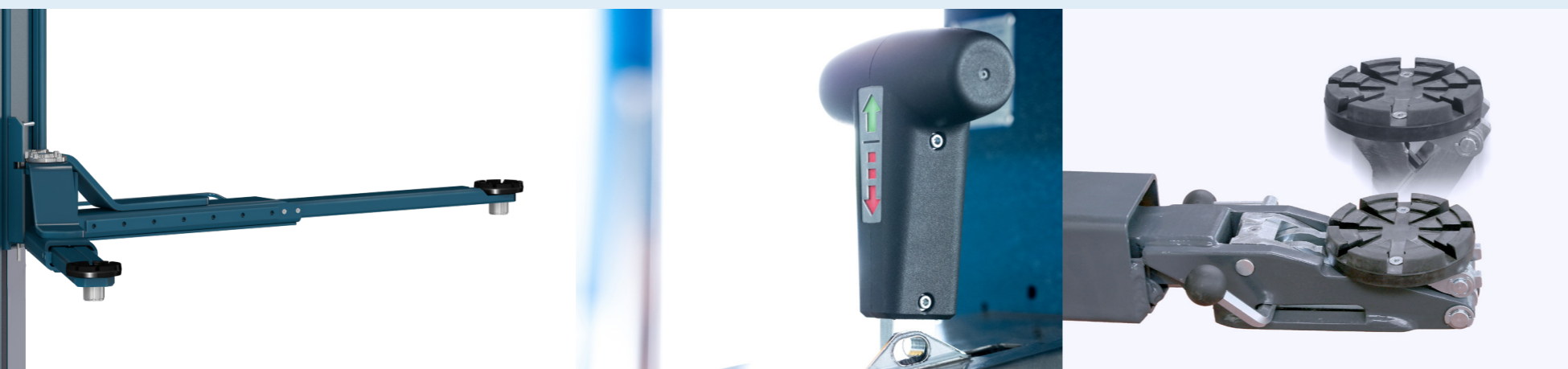
SC (Sports car arms): extremely flat construction. Very sturdy, made of solid material. Especially suitable for very low and wide sports cars.