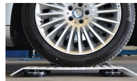
Drive-on plates (4 units)