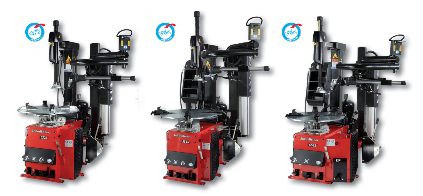
TABLE-TOP TYRE CHANGERS WITH PROSpeed TECHNOLOGY