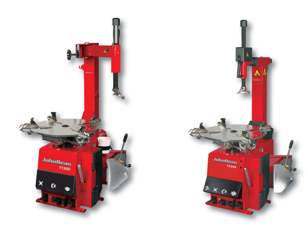
TABLE-TOP TYRE CHANGERS OF T1300 / T 5300 SERIES